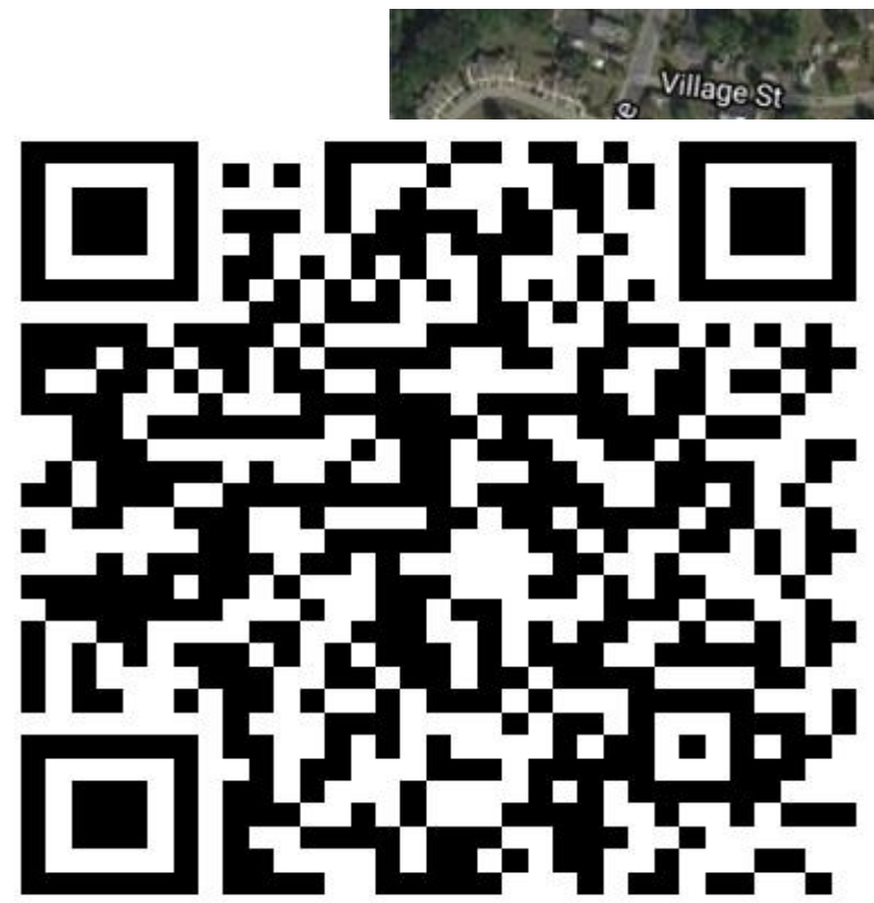
Fig. 2 (Far Right) The interactive Google map of Peter's Rock park. (Near Right) The QR code that is on a sign at the park is used to access the map on your phone. (Bottom) The static map, created by SCROG.