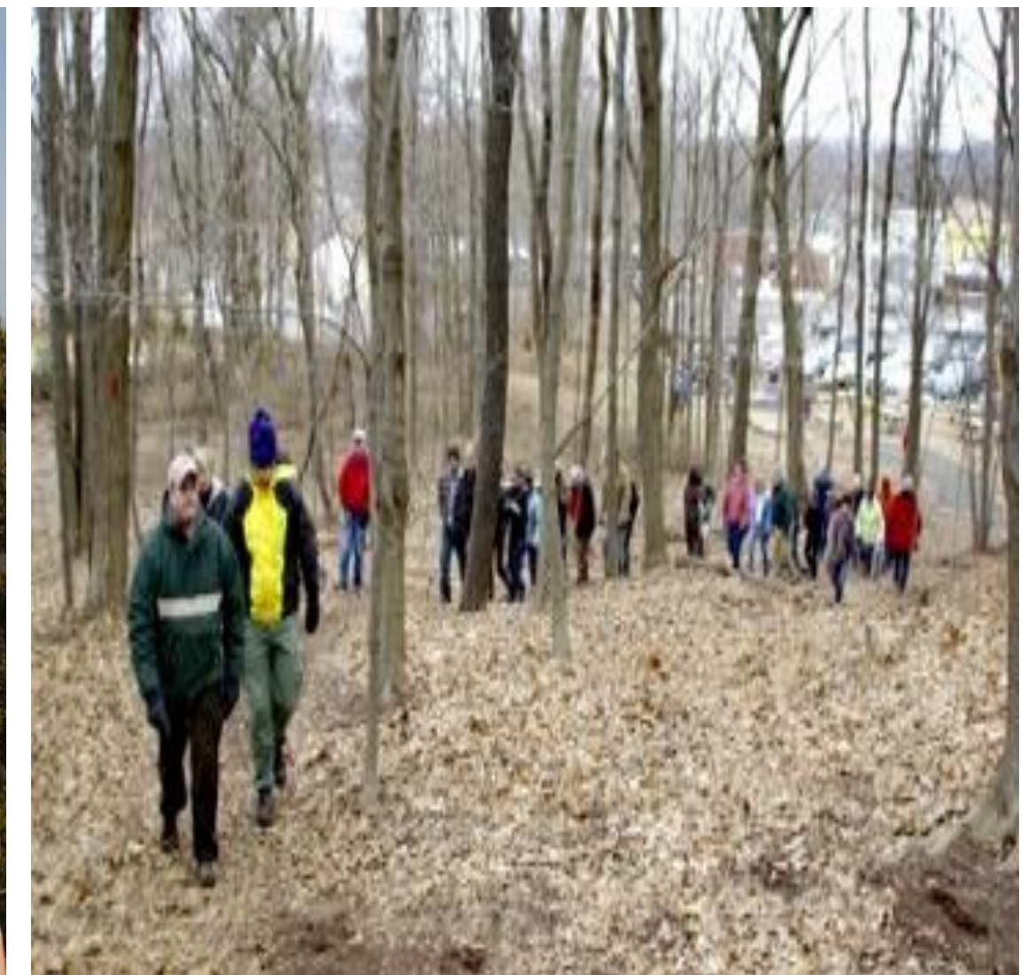
Fig. 1 (Left) A group of hikers at the summit of Peter's Rock. (Right) A group of hikers exploring one of the trails.