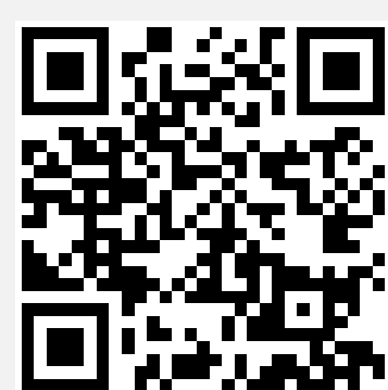
Figure 2. This Google Map showcases the waypoints where different aquatic species were seen, including descriptions of each species. View the map using the QR code or visit: https://goo.gl/cCUvgZ