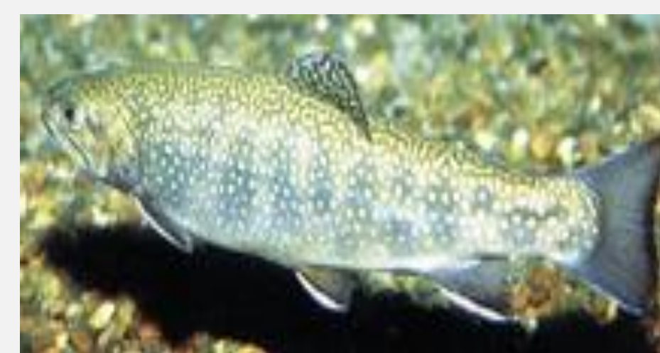
Figure 1. Fish species observed in the Q. From left to right: Bluegill ( Lepomis macrochirus ), Yellow Perch ( Perca flavescens ), Largemouth Bass ( Lepomis macrochirus ) and Brook Trout ( Salvelinus fontinalis ).