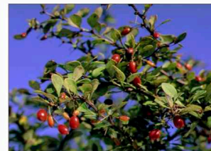
Japanese Barberry (Harmon, 2006)

The 3 pictures above are of Oriental Bittersweet; which is native to Eastern Asia, Korea, China, and Japan. Its scientific name is Celastrus orbiculatus . Oriental Bittersweet was introduced in 1860 to the United States as an ornamental vine used primarily in landscaping and was identified in Connecticut in 1916. This vine produces a distinct red-orange fruit that has a yellow covering prior to maturity. Oriental Bittersweet reproduces by seed production which is dispersed by birds such as blue jays, mockingbird, and European starlings. This invasive climbing vine can strangle native vegetation or smother by excessive shading. The native plant American Bittersweet is being out competed by the Oriental Bittersweet. There is also a concern that the native Bittersweet has hybridized with the Oriental Bittersweet reducing variation. These vines can be found in forested areas, woodlands, and coastal area. It can be found in shade but more often is found in sunny areas. The selling of this species in Connecticut is prohibited and punishable by a fine (UConn, 2009).