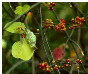
Oriental Bittersweet (NPS, 2009)

Veterans Memorial Park is located in Watertown Connecticut. Veterans Memorial Park is a town park that is 100 plus acres in size and located on Nova Scotia Hill Road. This is a multipurpose park that includes a playground, gazebo, comfort station, walking trails, Latin's Pond for fishing, a pavilion, horseshoe pits, bocce courts, picnic tables. A wooded area was selected within the park to identify two invasive species Oriental Bittersweet and Japanese Barberry that are having a negative affect on native vegetation.