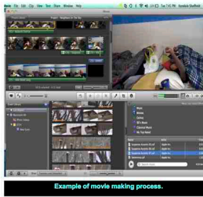
Example of movie making process.