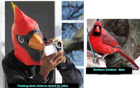
Tracking down birds to record for video

Our Goal is to make the first in a series of videos that will focus on 10 to 20 birds most commonly found in a specific habitat in Northwestern, Connecticut. In our videos, the information will be presented in a lively and educational manner in an effort to make the learning accessible to any age group. By approaching birding in a fun and easily handled increments, we hope to relieve the frustration new birders often encounter and to help them gain confidence in their birding skills by focusing on fewer birds at any one time. We believe this gradient learning system will lead to more life-long bird watchers and ultimately active conservationists within their local and global communities.