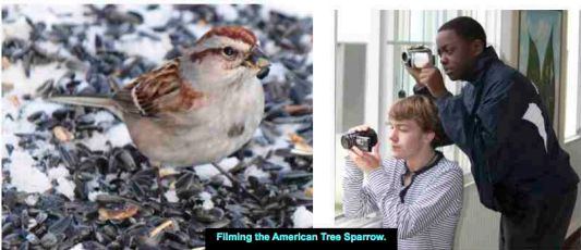
Filming the American Tree Sparrow.

Software - We used Apple's Movie to edit our videos, pictures and still slides together into our main video. Raw HD footage had to first be convert using a program called Wondershare Video Converter installed on Ms. Doss's computer. We made stills of the "beginner's" cheat sheet slides" made using Microsoft PowerPoint that showcased the key features for each of the species.