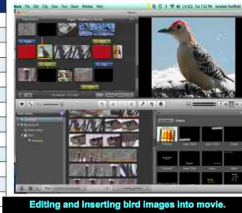
Editing and inserting bird images into movie.