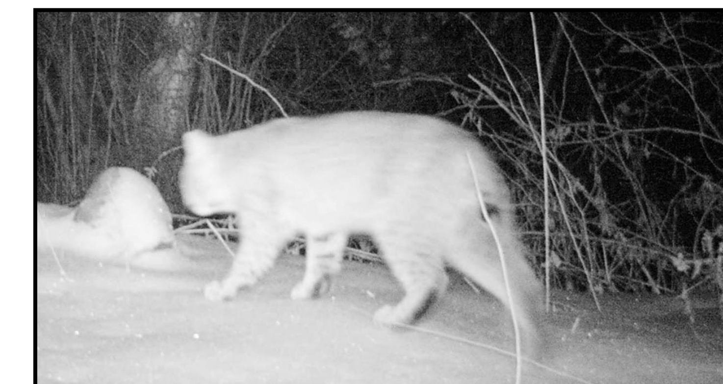
Figure 4. A curious bobcat examines the rock that the scent was sprayed on.