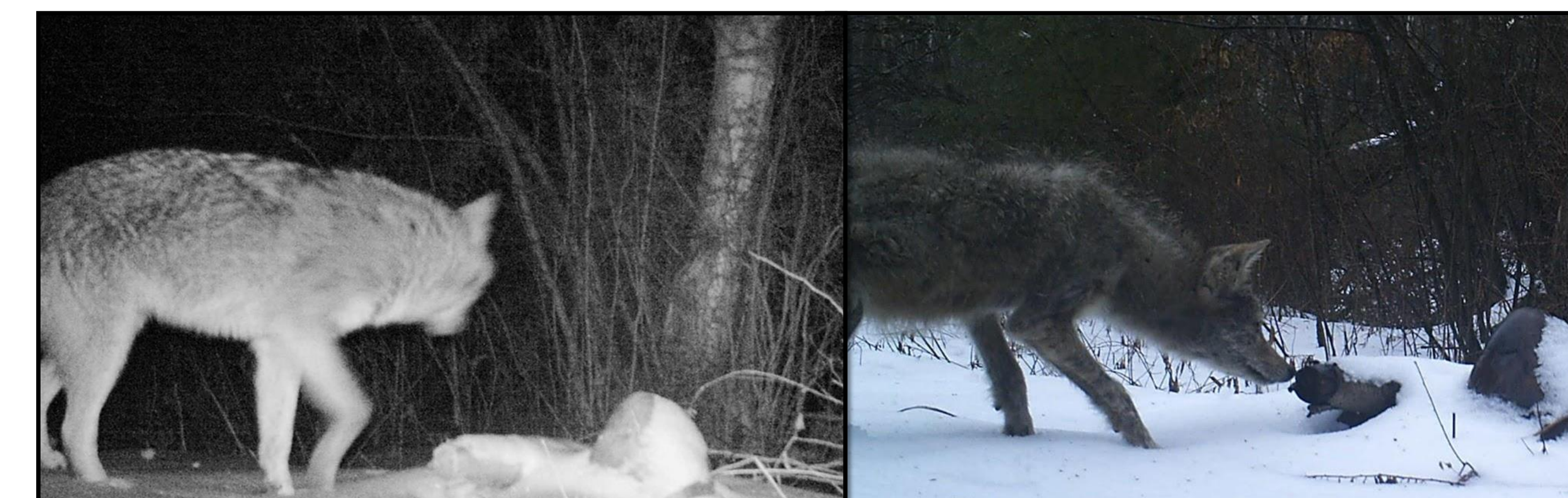
Figure 5. A few coyotes who are also curious examine the sprayed area.