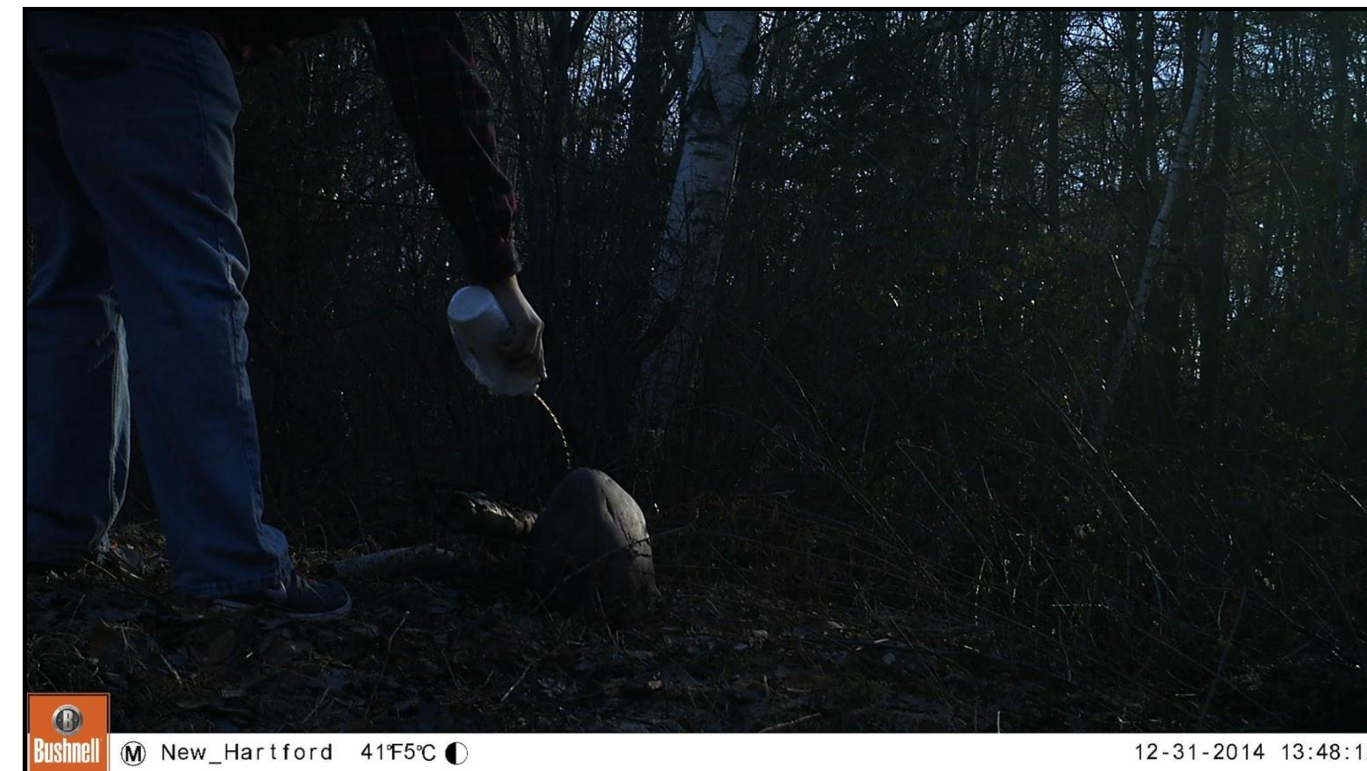
Figure 2. This is the object that was set up as “territory” marked by a mountain lion scent. These cats are known to spray scent on and around things in their territory.