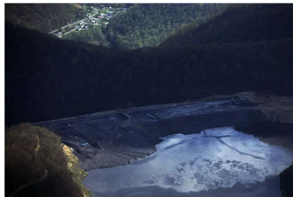
In West Virginia, one of many lagoons that hold slurry, water used to remove impurities from coal. Such water can seep into local drinking supplies.

However, that is about equal to the revenue those businesses' parent companies collect every 10 hours, according to financial reports. (To find out about every state's enforcement record and read comments from regulators, visit www.nytimes.com/waterdata .)